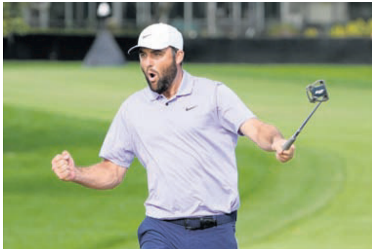
Scottie Scheffler celebrates after a birdie putt on the 15th green during the final round of the Arnold Palmer Invitational golf tournament Sunday, March 10, 2024, in Orlando, Fla.